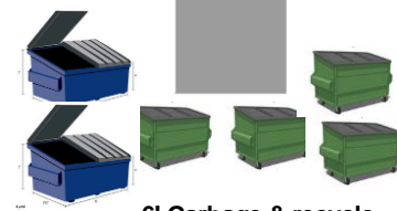
6' Garbage & recycle Dumpsters (Waste Management)